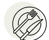
Delicious Meals and Whatnot!